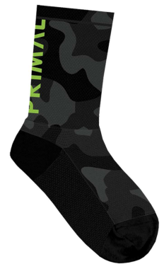
Socks (6" cuff)