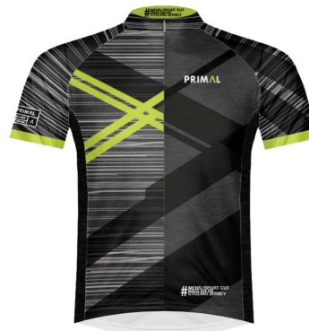
Sport Cut Jersey